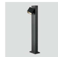
C-12 Bollard Lighting: 12W. Page. 376