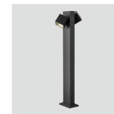
C-12D Bollard Lighting: 18W. Page. 376